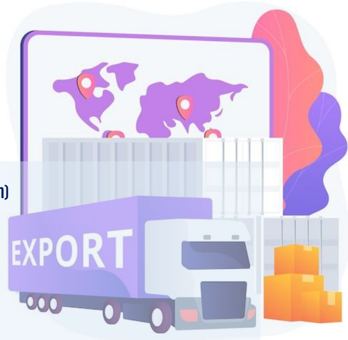
Key Districts Contributing to Exports – 2022-23 (USD Mn)

West Bengal's strategic location, well-established ports and export-friendly infrastructure positions it as a significant export hub in India